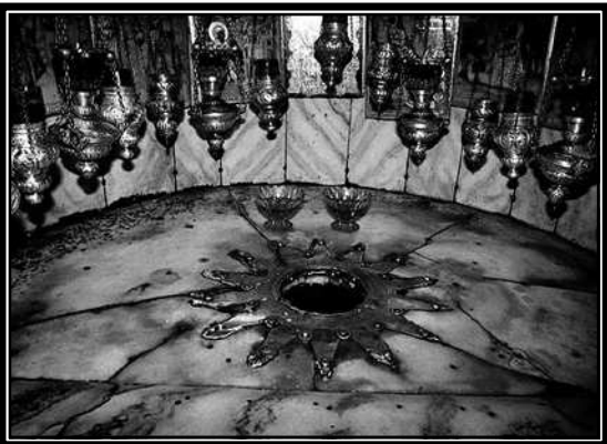
A star in the floor of the cave marks the spot where Jesus is believed to have been born.

after all the years and all the events that have transpired in the Holy Land over the last four millennia to 'nail down' many of the actual sites. Therefore, much is left to tradition and there is disagreement over even some of the major sites including Calvary and the tomb.