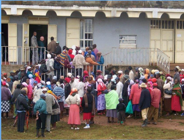
Good Samaritan Outreach's ministry