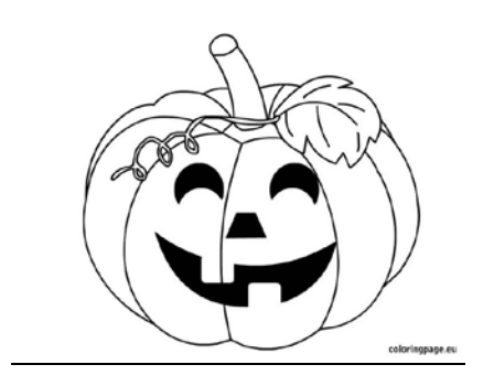
Halloween Oct. 31st

A 10 year old little girl was asked by another classmate, "what is it like to be a Christian?" The girl replied, "it's like being a pumpkin. God picks you from the patch, brings you in, and washes all the dirt off you. Then he cuts open the top and scoops out all of the yucky stuff. He removes the seeds of doubt, hate, greed, etc., and then He carves you a new smiling face and puts His light inside of you to shine for all the world to see."