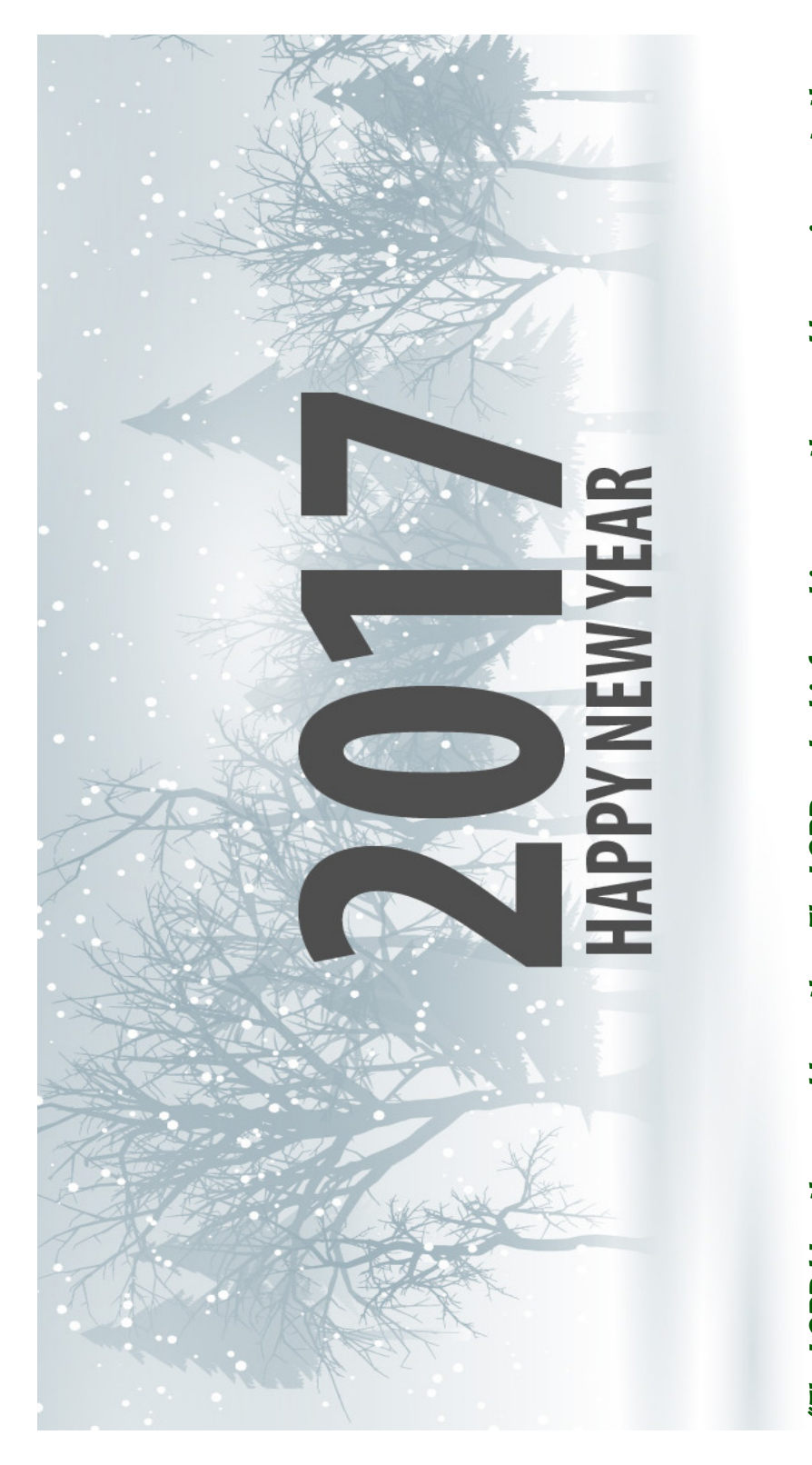
"The LORD bless thee, and keep thee: The LORD make his face shine upon thee, and be gracious unto thee: The LORD lift up his countenance upon thee, and give thee peace." Numbers 6:24-26 www.mlibc.org Mountain Lake Independent Baptist Church