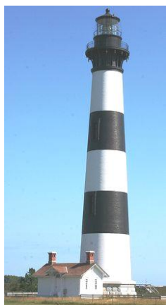
Bodie Island Lighthouse

Thanks for your help in sending kids to camp!