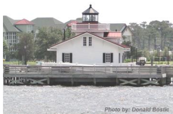
Roanoke Marshes Lighthouse