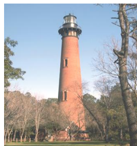
Currituck Beach Lighthouse