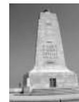
Wright Brothers Memorial