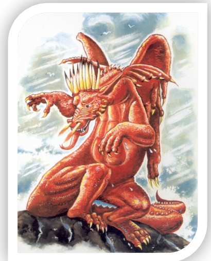
“Dreadful & Terrible”