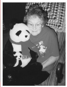
Happy Mother's Day 2003