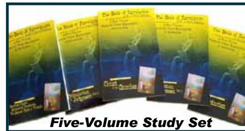
Five-Volume Study Set

Mini-brochure teaching series for children on Bible Memory, Death, Life & Creation