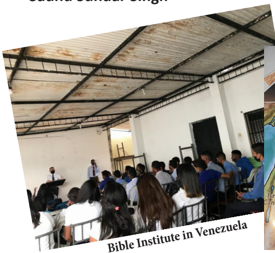
Bible Institute in Venezuela