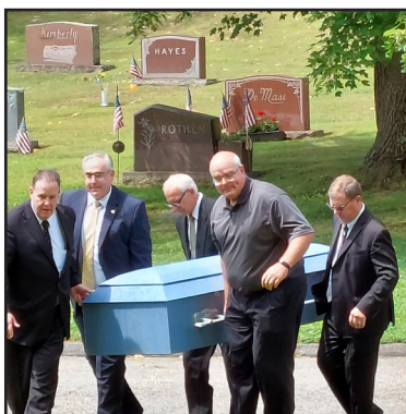
Funeral in Connecticut