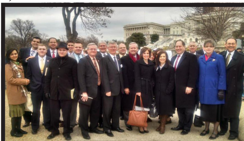
Hundreds of Preachers canvassed Capitol Hill. NC had the largest group present. Thank you Capitol Connection for the opportunity.