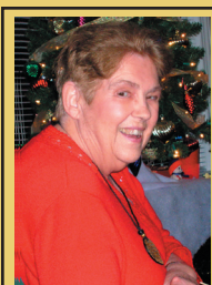
With the Lord 08.25.08

What a day it will be when all the saints gather for that glad reunion. So many have passed on before. Heaven is indeed sweeter with the joyous thought of seeing our Saviour and all of our loved ones. This year is marked by the passing of several dear pastor friends and the homegoing of my