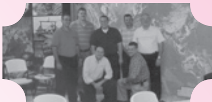
Pastor's Summit - See Full Color Photo-Journal On Pages 7-10

SIGN UP FOR The Weekly Voice AT www.thevoiceinthewilderness.org