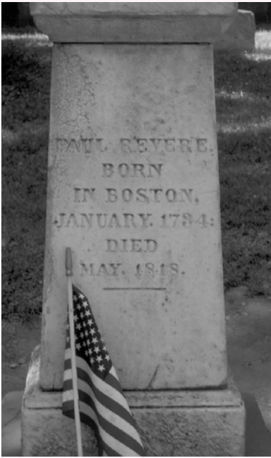
Paul Revere was born in Boston in January of 1734 and died in May of 1818. At this site, it was sad to hear that an elementary student did not even know who Paul Revere was or what he had sacrificed for our country.