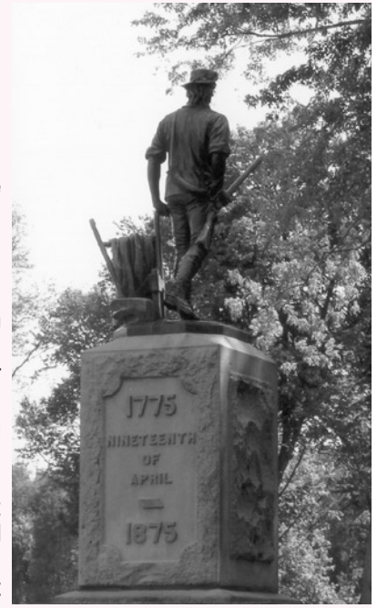
Minuteman monument in Lexington, Massachusetts. It was erected 100 years after initial battle on April 19, 1775 in the American War for Independence.

Born of French Huguenot descent in December 1734, Paul Rivoire (later changed to Revere) entered the New World. At age thirteen, Paul got involved in ringing the bells at his church, and, along with his friends, organized the Bell Ringers Association. Young Paul studied in Boston, became a silversmith, and eventually served in the French and Indian War. As the Colonies' desire for freedom mounted, Revere became politically active as leader of the Boston craftsmen. He was one of those in the Boston Harbor on December 16, 1773. The Boston Committee of Correspondence and the Massachusetts Committee of Safety hired him as a courier. With these qualifications, he was chosen by a Patriot leader, Dr. Joseph Warren to warn Lexington and Concord of the eminent attack of the British troops. Riding quickly, Revere not only warned the Patriot leaders endangered of being captured by the British, but also alerted all other colonist to take up arms to defend their liberties. Amazingly, some were not interested in news of the British and demanded that Revere deliver his news more quietly. Revere adamantly replied, "Noise! You'll have noise enough before long. The regulars are coming out!" With this enthusiasm and determination, nothing could squelch this desire for a free country.