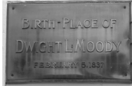
A plaque has been placed to the right of the front door of the birthplace of Moody.

wife and said that these girls should have an education that they may learn not only academically but also spiritually. This was the start of the Northfield Seminary for girls (a seminary in those days was considered a high school).