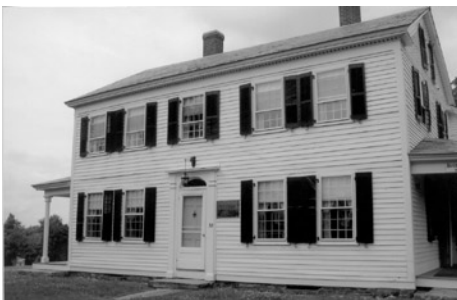
Birthplace of D.L. Moody. The right porch is an entryway to his study where his books, Bible, and Sankey's organ are currently housed.