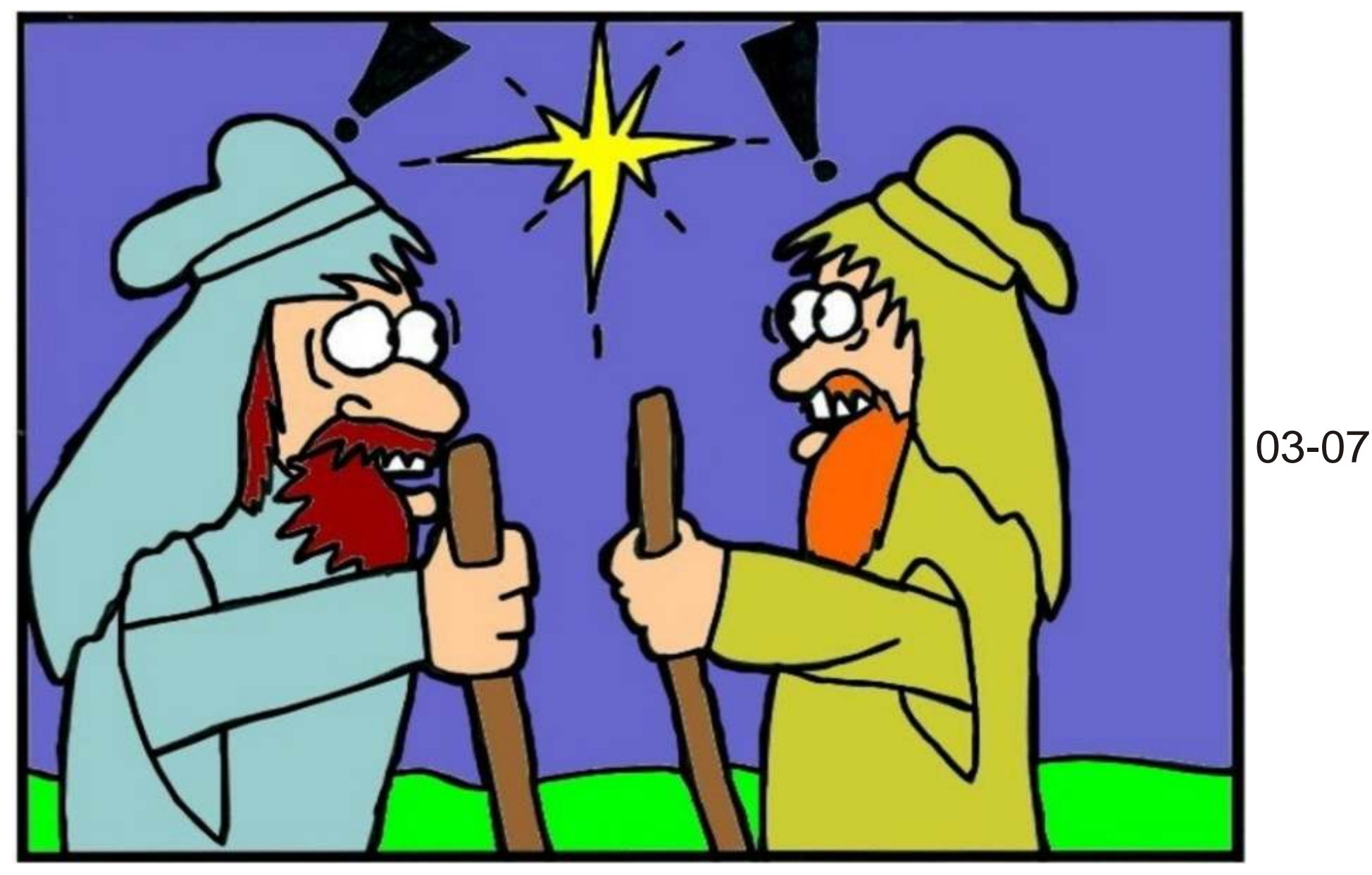
"Whoa! Did you see that?" Exclaimed the shepherds to each other. "Let's go to Bethlehem and see this thing that happened, which the Lord told us."