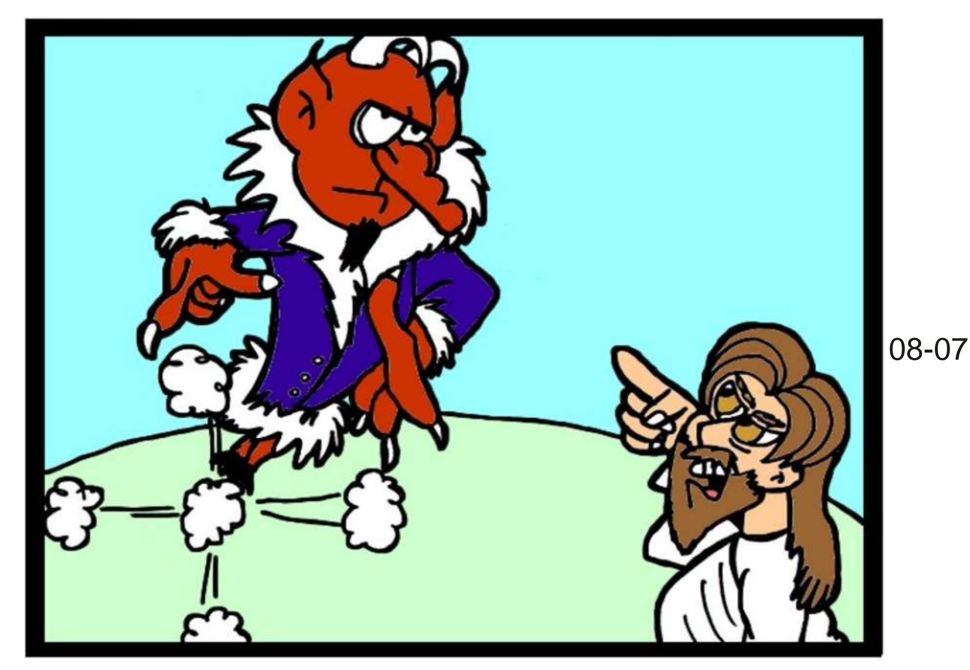
"Get out of here Satan!" answered Jesus. "You shall worship the Lord your God and him only you shall serve."