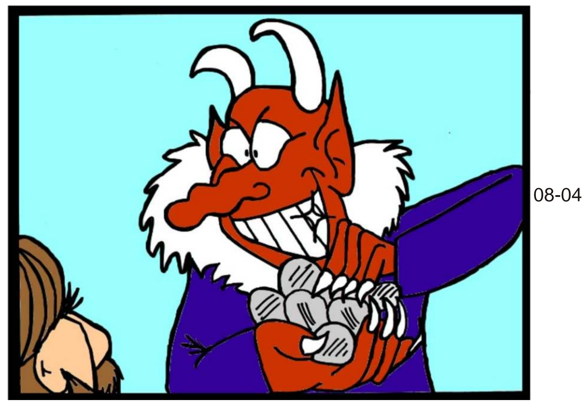
"If you are the Son of God," said Satan, "Command that these stones become bread."