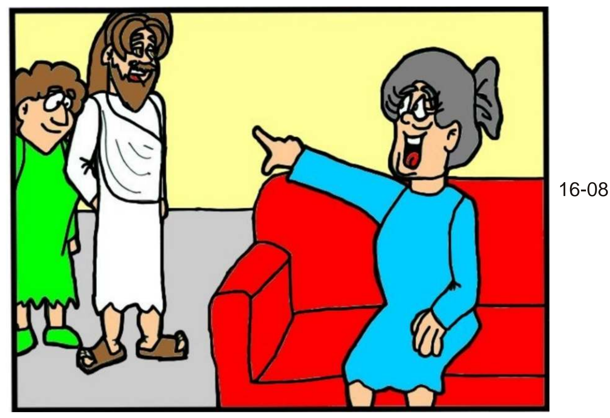
"I feel all better now. I'll just get up and take care of you boys," said the older lady. And that's just what she did.