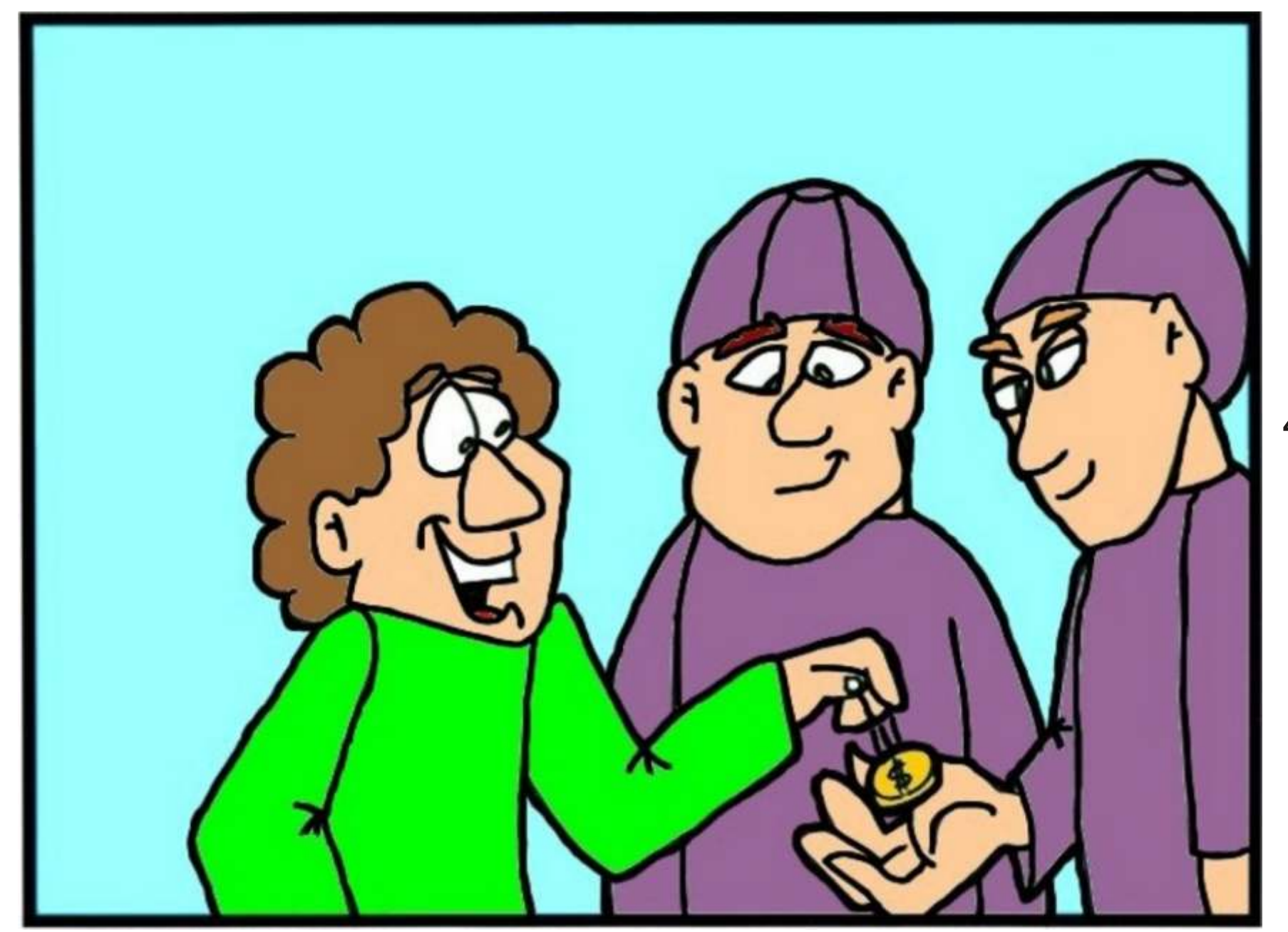
"Take it and go pay my taxes and your taxes too."